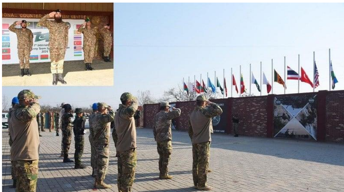
The opening ceremony of 7th International Pakistan Army Team Spirit (PATS) Exercise-2024.

LAHORE: The Punjab government has fully activated the Narcotics Control Department (NCD) with a serving army brigadier taking charge of the post of its director general, in order to purge the province's educational institutions of drugs abuse.