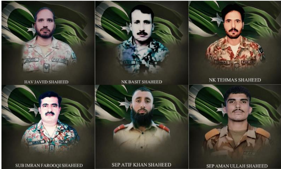
Names and pictures of soldiers martyred following an attack on a checkpost in KP's Bannu district.

Twelve personnel were martyred while six terrorists were killed after a checkpost was targeted in the Mali Khel area of Khyber Pakhtunkhwa's Bannu, the military's media affairs wing said.