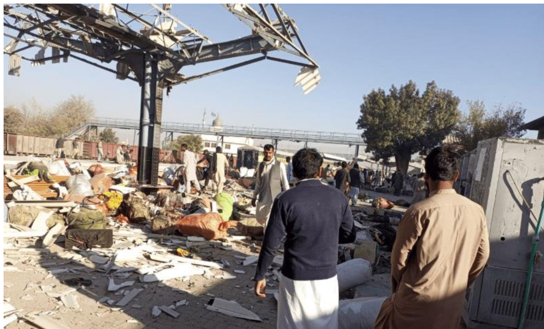
This photo shows the aftermath of a blast at Quetta Railway Station on November 9.

At least sixteen people were killed and 30 injured on Saturday in a blast at Quetta Railway Station, a police officer said.