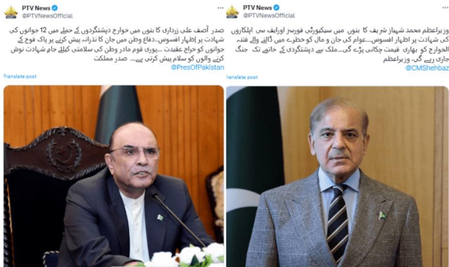
Collage of posts on X by PTV News.

Meanwhile, PM Shehbaz asserted: “The sacrifices of the nation’s soldiers will never be squandered. The Fitna Al Khawarij posing threats to the lives and properties of the people will have to pay a heavy price for it.”